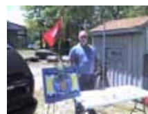
Glen working table