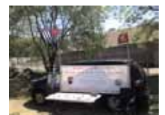
Booth setup at Ramp

Week of 17 May 2008 started National Safe Boating week and Memorial Day weekend WCSART set up a booth at the Corazzini Ramp in Shrewsbury, MA to promote Boating Safety and to give out information about Lake Quinsigamond, Rules and Regulations as well as pass out booklets on Massachusetts Boating Laws and our WRSP Patrol information Business Card to alert Boaters of our Water Rescue Service. We also handed out information about the US Coast Guard Auxiliary and Worcester County Sail & Power Squadron as to what they do for the boating public here in Worcester County. Our Booth was setup for two days, Sunday and Monday (Memorial Day) and it was a great success. After the two-day setup, all our Flyers and booklets were handed out and we met allot of great boaters using Lake Quinsigamond.