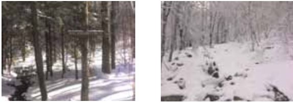
Snow covered Trails on Mt. Wachusett

The MRSP Team headed up by Chris Maider is now inactive for the summer season and will startup again in the late fall. Our MRSP weather update on our Web Site Main Page has been discontinued until our MRSP Patrols start again in Dec.